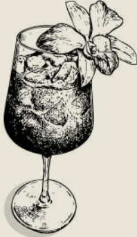
LUNA SPRITZ | $22 Bombay Sapphire, Aperol, Lychee-Shiso Cordial, St. Germain, Yuzu, Prosecco