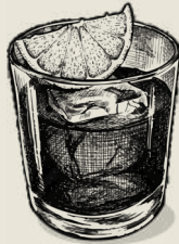
THE RED DRAGON | $20 Bombay Sapphire, Martini Rosso Vermouth, Campari, Wasabi, Yuzu Tincture