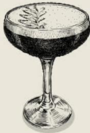
JADE CLOUD | $24 Grey Goose, Licor 43, Creme de Cacao, Matcha, Ube