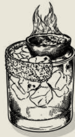
PAPI SOLUNA | $24 Guajillo-Infused Herradura Reposado, Cointreau, Passion Fruit, Lemon, Tajin