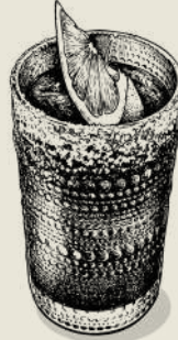
TOKYO PALOMA | $23 Pea Flower Infused Patrón Silver, Shiso-Yuzu Sour, Grapefruit Soda