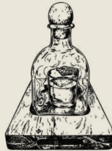
OAXACA DRIFT | $24 Toki Whisky, Mezcal, Miso Honey, Hopped Grapefruit, Honeycomb Tuile, Smoke