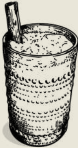
ENDLESS SUNSHINE | $19 Bacardí Superior, Cachaça, Licor 43, Horchata, Yuzu, Sugar