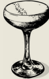
RICH & FAMOUS | $24 Belvedere Organic Vodka, Passion Fruit, Vanilla, Lime, Veuve Rich Champagne Foam